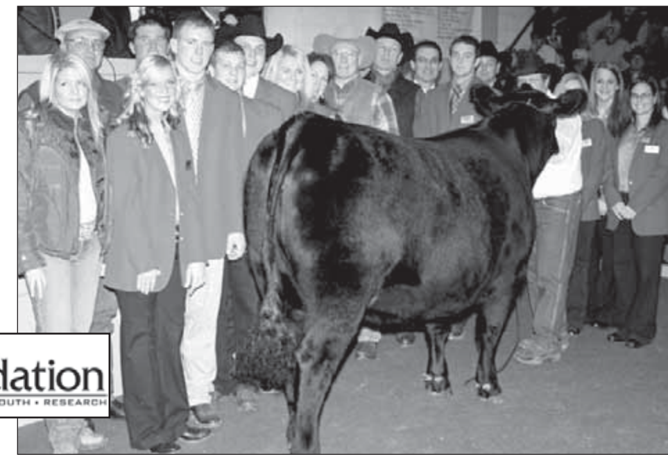
The 2007 Angus Foundation Heifer Package sold for $135,000 during the National Western Stock Show. Proceeds will benefit education, youth and research.

It was a very exciting moment — not only for the Angus Foundation, but also for the juniors — to see there are people who are giving and want to help support the Angus Foundation. As juniors of this Association, we should be thankful for their support and for the support the adult Association gives to us. Without the purchase and the donation of