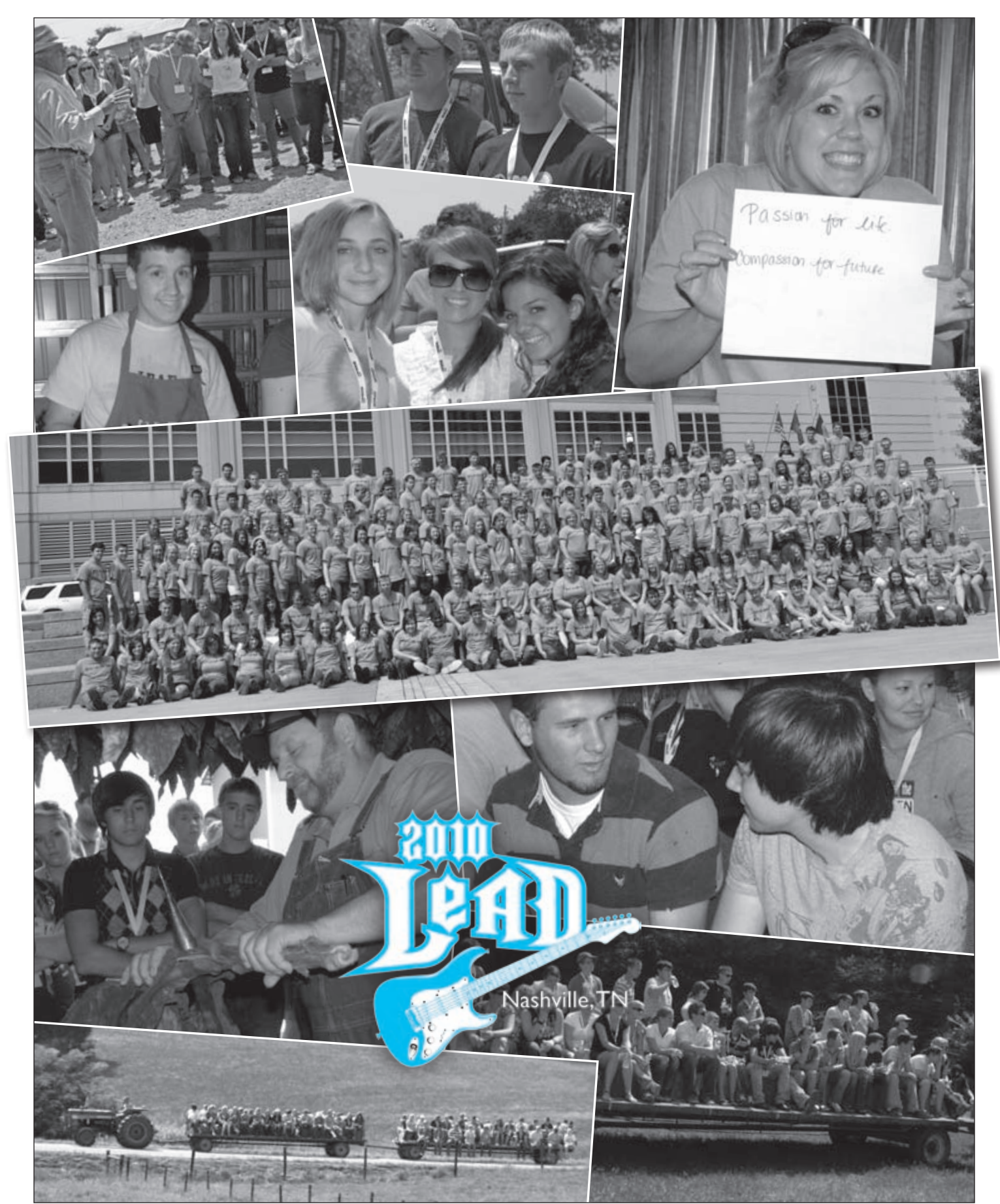
The 2010 LEAD conference, "Angus: Live & Loud," was Aug. 5-8 in Nashville, Tenn.