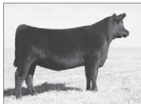
BT Everelda Entense 51N