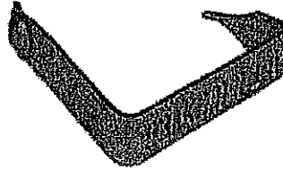
USDA Silver Metal Tag