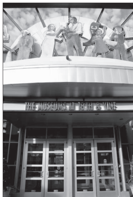
Above: Located in the heart of downtown, The Museum of Contemporary Music is the first in the country devoted exclusively to this specific music genre.