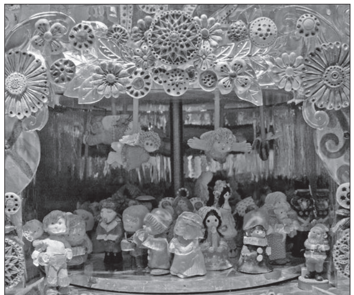
Founded in 1910, this now $4.1 billion business is still owned by members of the founding Hall family. With cards sold in 100 different countries, chances are you've received a _____ Card (this photo was taken at their Visitor's Center).

Answers to be posted on NJAA Facebook page.