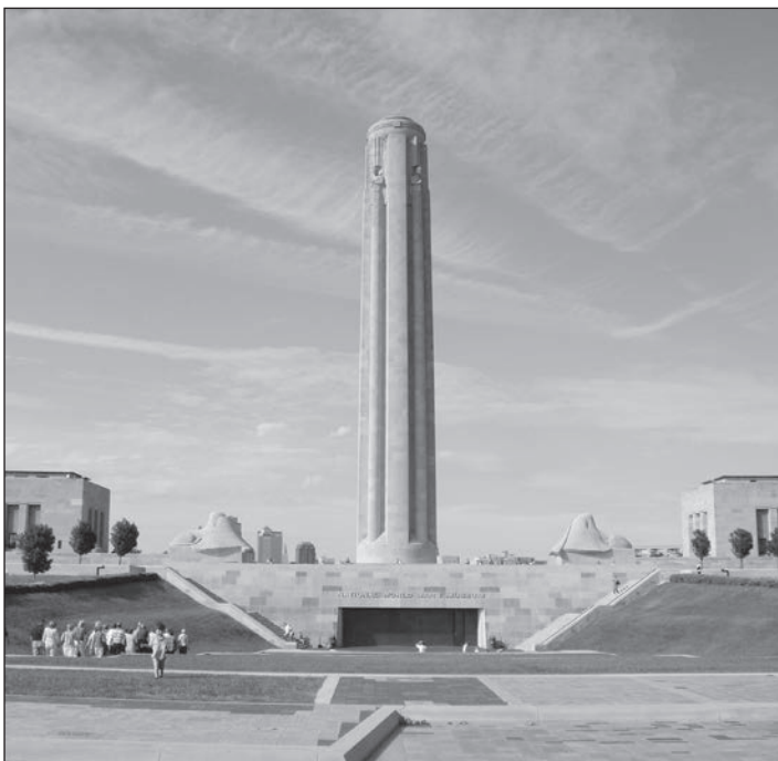
The _____ Memorial is the only national monument exclusively dedicated to World War I. These words can be found inscribed on the main tower: "In honor of those who served in the world war in defense of liberty and our country."