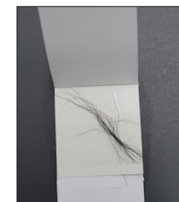
No root ball