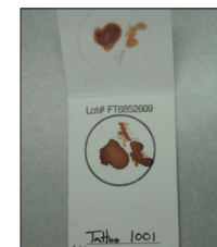
Not enough blood