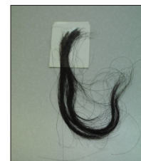
Excess hair not trimmed