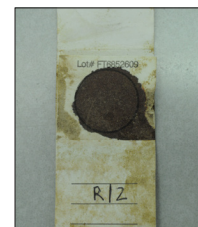
Contaminated with feces